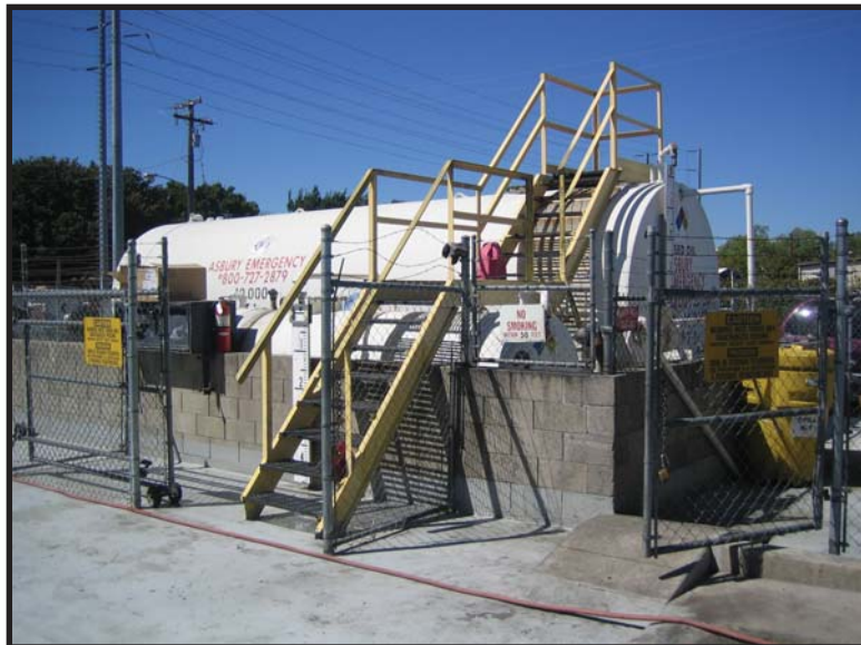
Tank Storage Area

DTSC regulates the generation, storage, treatment and disposal of hazardous waste in California. A permit enables DTSC to effectively regulate the hazardous waste management activities at facilities. Permits are developed after DTSC's detailed technical review, and are intended to ensure that the facility operates in a manner that protects human health and the environment.