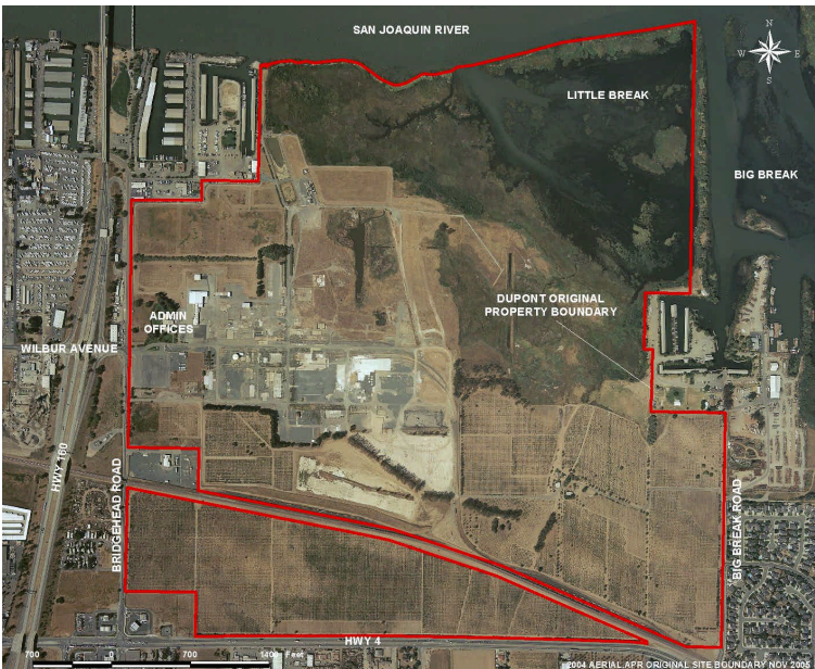
Figure B. DuPont Facility – Original Boundary

All confirmation soil sampling results showed no soil contamination present above state cleanup levels. Groundwater has not been affected at this