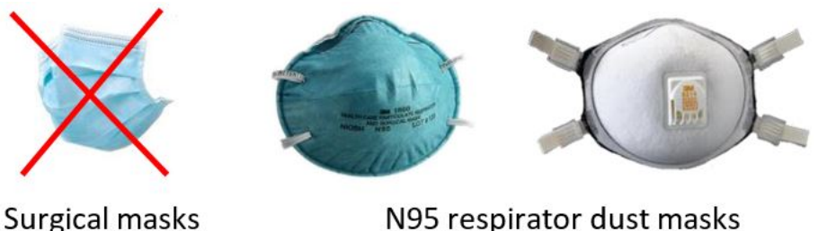
N95 respirator dust masks

9. Salon owners must evaluate the workplace<sup>4</sup> to determine whether respirator use is necessary to protect worker health<sup>5</sup> and provide NIOSH-approved N95 respirator dust masks to prevent worker exposure to dust when buffing/filing nails, and providing acrylic nail services. It should be noted that NIOSH-approved N95 respirator dust masks do not protect workers from chemical vapors and gases.