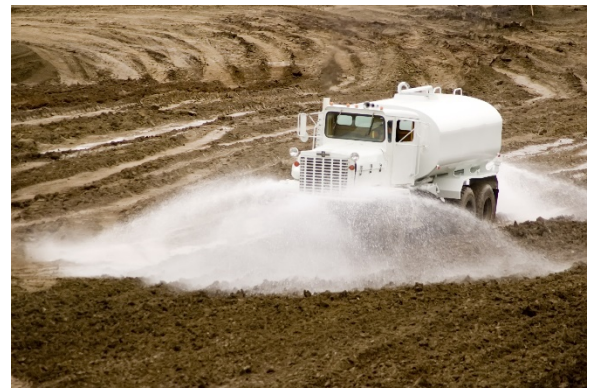
Water will be sprayed on stockpile soil and other areas as needed to control dust.