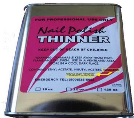
Figure 1. Toluene was listed on the ingredient panel of a thinner

Nail salons typically use 0.5 fluid ounce bottle of products for multiple applications. Repeated openings of the bottles allow volatile chemicals such as solvents to evaporate resulting in undesirable product consistency. A common practice among nail technicians is to add thinners to maintain the consistency of the polishes to aid application and to ensure a satisfactory finish. During sampling, staff observed toluene on the ingredient panel of a nail polish thinner (Fig. 1). Therefore, two thinners were collected for analysis. A sampled container of thinner is shown in Fig. 1 (NPR-0517-H); the other thinner (NPR-0518-A) did not have an ingredient panel.