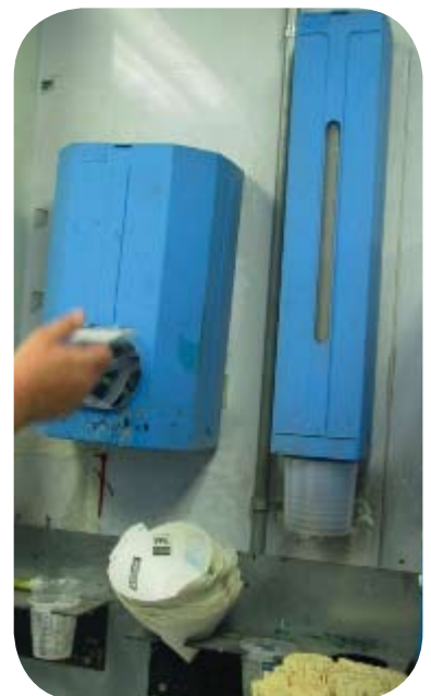
Disposable paint cup liners

Using paint gun liners can reduce paint and solvent waste, and provide cost savings. One product, the Paint Preparation System (PPS) (see vendor list), consists of a disposable liner and cap inserted into a reusable plastic shell that attaches to a gravity-fed paint gun. Paint, reducers, hardeners, and other additives are mixed in the liner. Unused paint or primer can be saved in the disposable liner for later use.