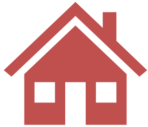
Older homes and buildings