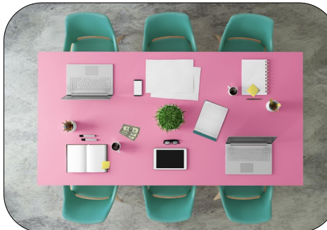
Workforce & Workplace