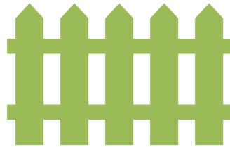
Soil, yards and playgrounds