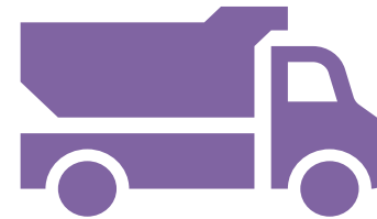
Jobs and hobbies